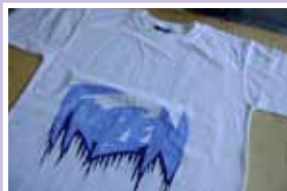
Student t-shirt: Phil Acevedo

Students will produce printed designs on fabric, t-shirts or paper.