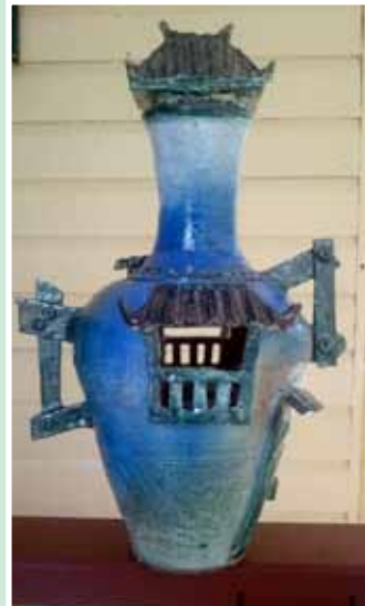
Ceramic Vessel, 2012

With assistance, all students can expect to produce successful pottery from these workshops. Glazes may be limited by the local availability of materials.