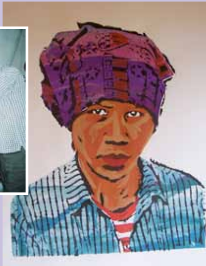
Market Portrait, Silkscreen print, 2009