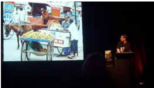
Photography presentation at 'The Tanks', Cairns 2011

From June to September 2013, visits can be arranged on a daily or weekly basis. The length and content of workshops can be negotiated depending on the needs, interests and resourcing of schools. Some workshops require access to facilities such as computers, cameras, or pottery kilns. Other workshops require no specialised materials or equipment at all.