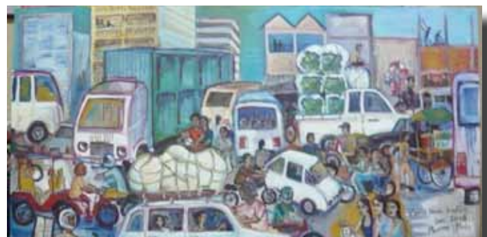
Cross town Traffic, Oil on Canvas, 2009

Workshops on curriculum development and artroom management can be tailored to individual school needs.