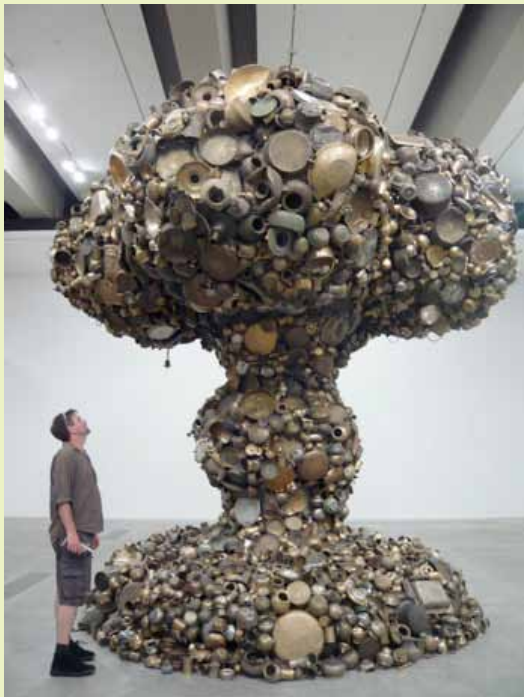
'Line of Control' Subodh Gupta