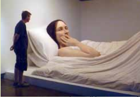
'In Bed' by Ron Mueck