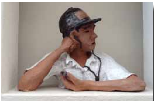
Lazy Schoolboy, Ceramic sculpture, 2012